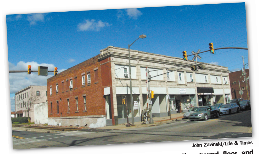
The Boyle Building today has storefronts on the ground floor and apartments above.

Fire gutted the Shenango House on Feb. 25, 1928, leaving only the out-